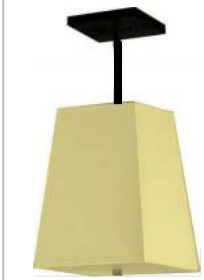
Quorum Ludlow 2 Light Pendant 30cmW