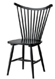
Black Trendig chair