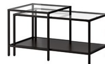
Vittsjo nesting table