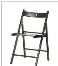
Folding chair Black & Copper