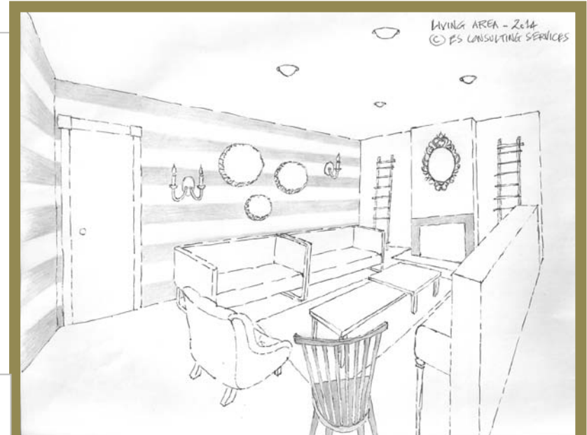
Living after with option 1

A Tiffany buttoned armless chair couples with a black Trendig chair will add a classic note. An existed piano anchors against the right wall. It is a family heirloom, and it needs to be revived. A TV set can be found right above the piano for weekend family movie night. To highlight the importance of a family value, portrait of family's offsprings is the wall art. It merges the two separate functional rooms of living and dining and certainly adds a warm spice to the interior.