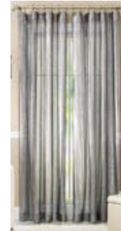
Option b - grey sheer curtain - ceiling to floor length

This home has too many clashed decor items, design theme, form and colour scheme. For a modern look, the area is required to declutter living and dining area for a fresh start.