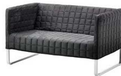
Charcoal Knopparp loveseat