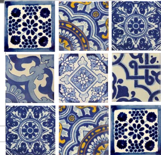
Nine mixed design Mexican hand painted tiles