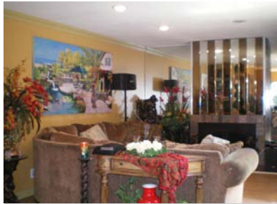
Living area before with out of date colour: mustard yellow wall