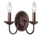
Livex candle twin wall lights

A modern, eccentric space oozes with a warm and luxurious flair. Introduce two sheer curtains over glass wall on either side of the fireplace