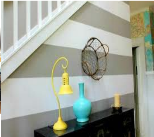
Proposed living after with left featured striped wall with soothing colour of light greyish tone and off-white colour. This application will make the room deeper visually. Other walls in living and dining will look fresher with an off-white colour. This will contribute to open the space