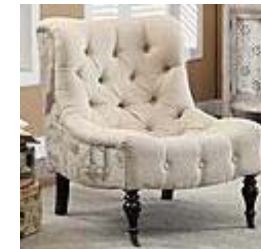
Tiffany accent buttoned armless chair