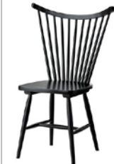
Black Trendig chair