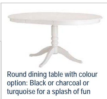
Round dining table with colour option: Black or charcoal or turquoise for a splash of fun