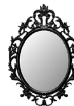
Black Ung-drill mirror