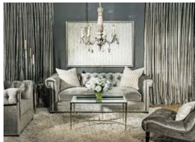
Luxurious finish with metallic sheer curtain on either side of fireplace

A modern, eccentric space oozes with a warm country classic with ladders used as makeshift shelving to display decorative items, such as old books, ceramic ware glass ware of complimentary shapes and shapes and colour scheme